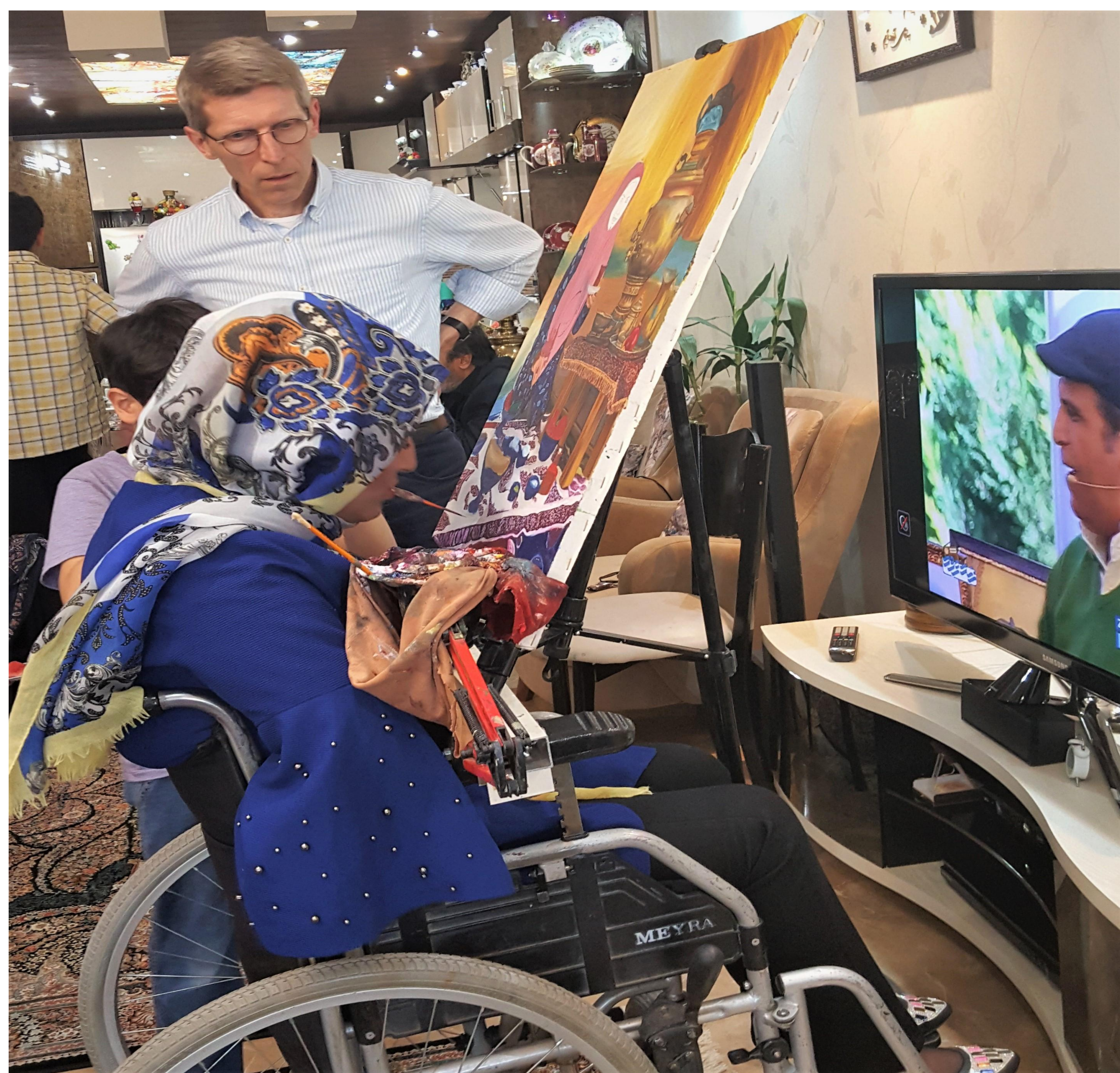
This image shows a girl with physical impairment sitting on a wheelchair and is drawing a picture using her mouth and lips. One of the German professors is also watching her.

In this study, a total sample Consist of 493 persons with disabilities, including 165 males and 328 females, ranged in age from 13 to 78 years. Of these, 306 (61.3%) were covered by Emam relief committee or welfare organization . 110 (22%) had visual impairment, 33 (6.6%) had hearing loss, 67 (13.4%) had spinal cord injury and 288 (57.7%) had physical-motor impairment.