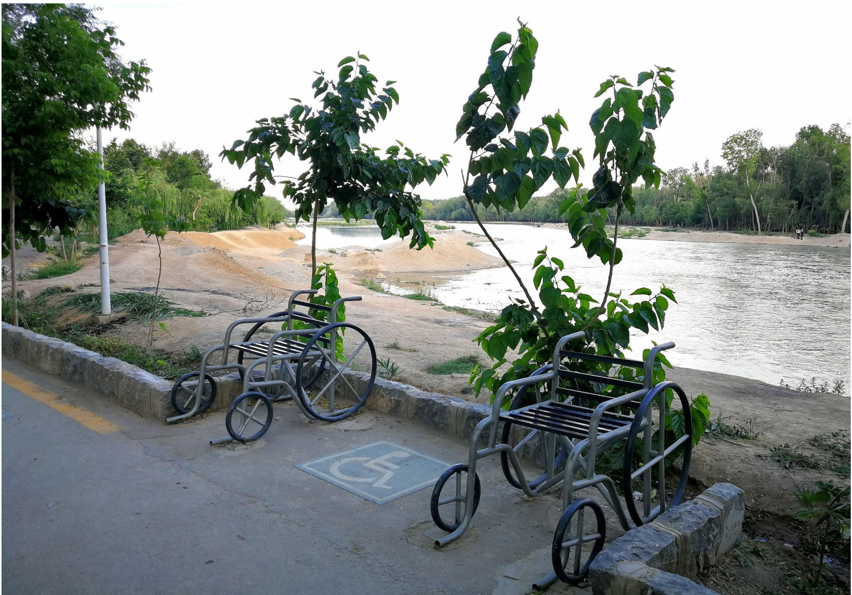
Picture: Visiting of the Disabled Health Road

The project was designed to be a cross-sectional study and we decided to gather all information through self-administered questionnaires. In some cases our colleagues help parents to complete questionnaires. In this process 449 questionnaire (268 women and 181 man) completed. The subjects selected randomly from disabled rehabilitation /community centers and institutions who supports disabled and their families. The instrument of this study was PATI (Parental Attitude to Inclusion), previously validated in Iranian population. Data was analyzed by SPSS-22 with descriptive and variance analysis method.