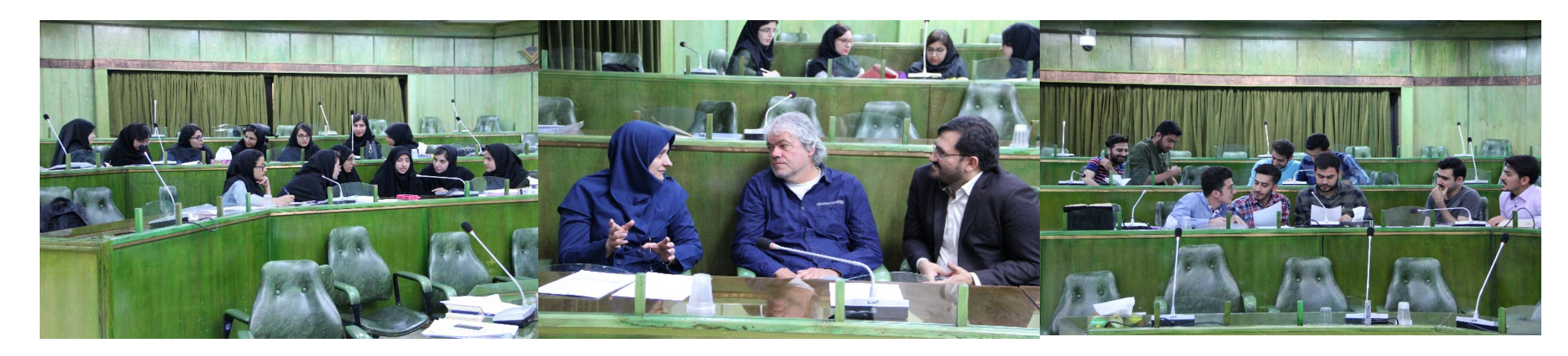
Picture 1: Students conducting group discussions at the first communication skills workshop